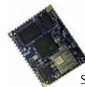
Size: 31 x 40mm